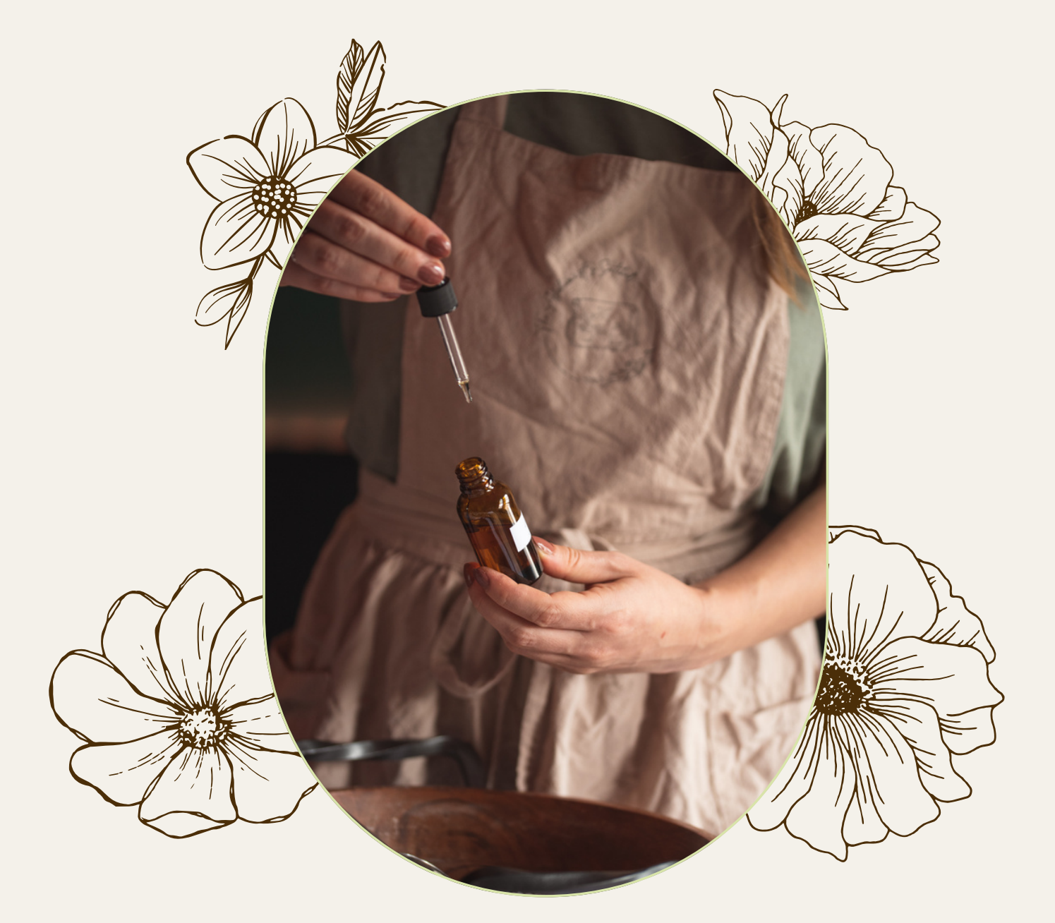
The Modern Apothecary